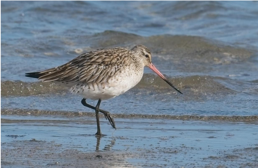
Bar Tailed Godwit – Juvenile or non breeding adult

Bar Tailed Godwit – 23 rd – 3, 24 th – 1.