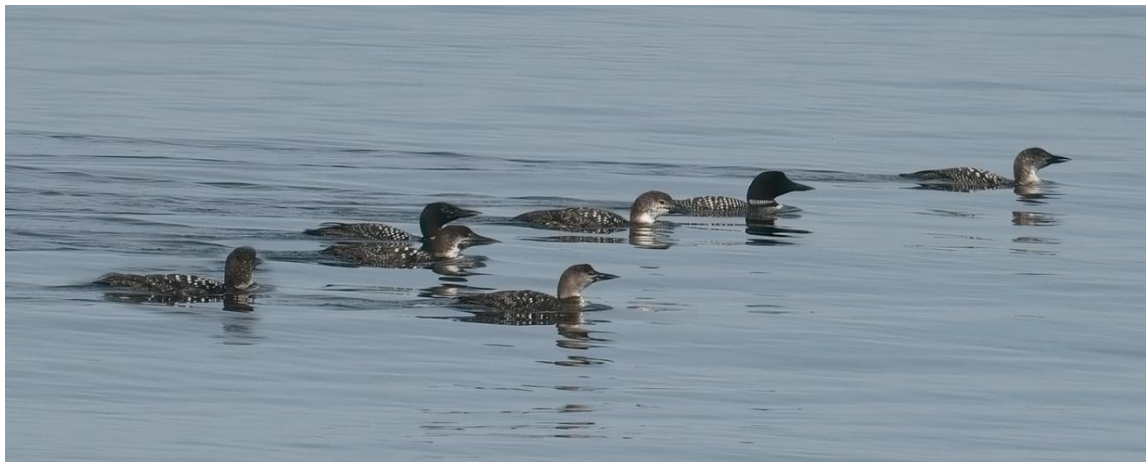
Great Northern Diver

Gannet – it is good to see them back in increasing numbers as the month goes on.