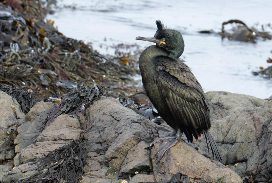
Shag with breeding crest