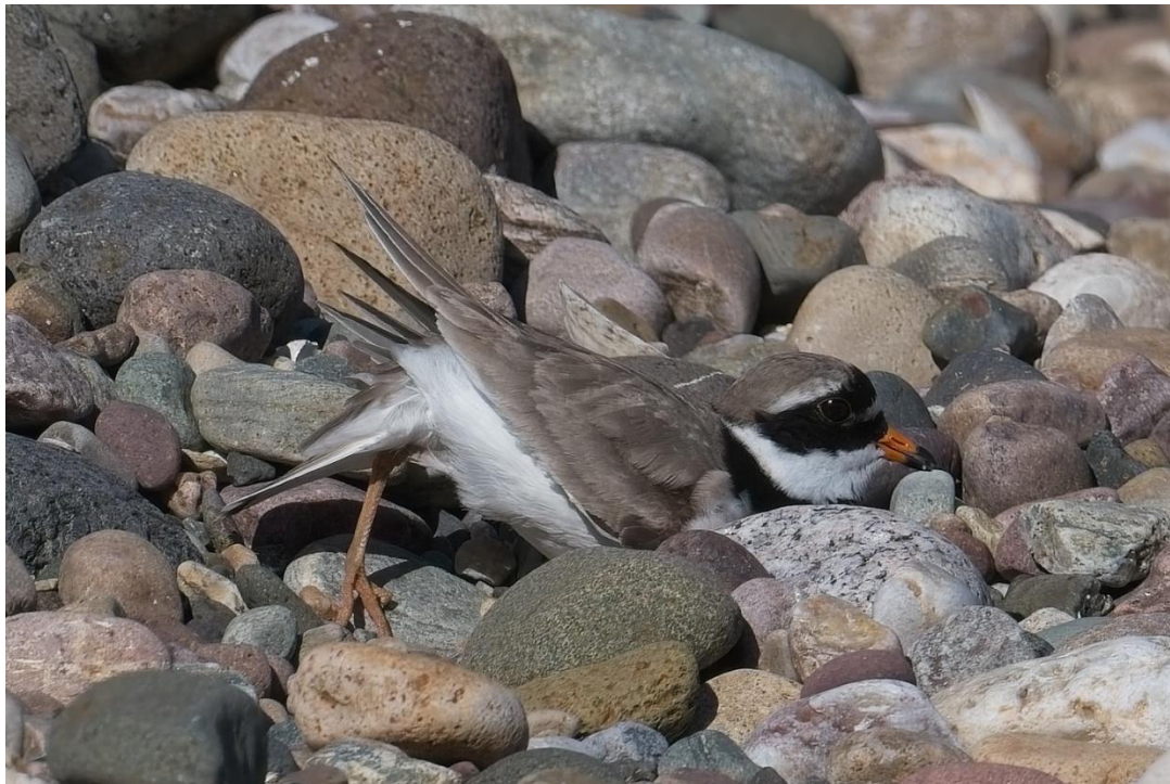
Ringed Plover – Looked like it was digging a scrape.

Purple Sandpiper – 1 st – 7, 2 nd – 4, 3 rd – 8, 6 th – 1, 10 th – 5, 11 th – 4, 16 th – 5.