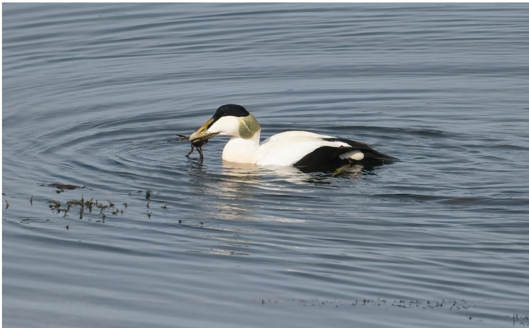
Male Eider with crab

Barnacle Goose – 2 flew though on the 16 th in the company of a Canada Goose .