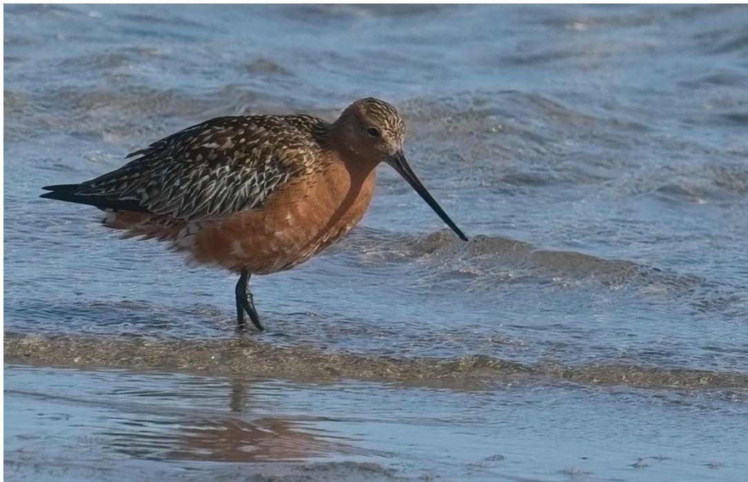
Bar Tailed Godwit - breeding male

Sedge warbler - first of the year seen by the stream on the 28 th .