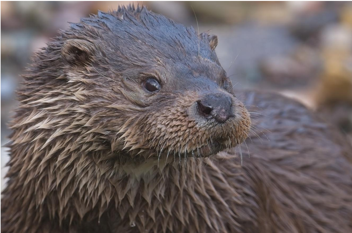
Otter , a regular visitor

Linnet – 10 th – 2, 21 st – 2, 23 rd – 2, 26 th – 1, 29 th – 5, 30 th – 2.